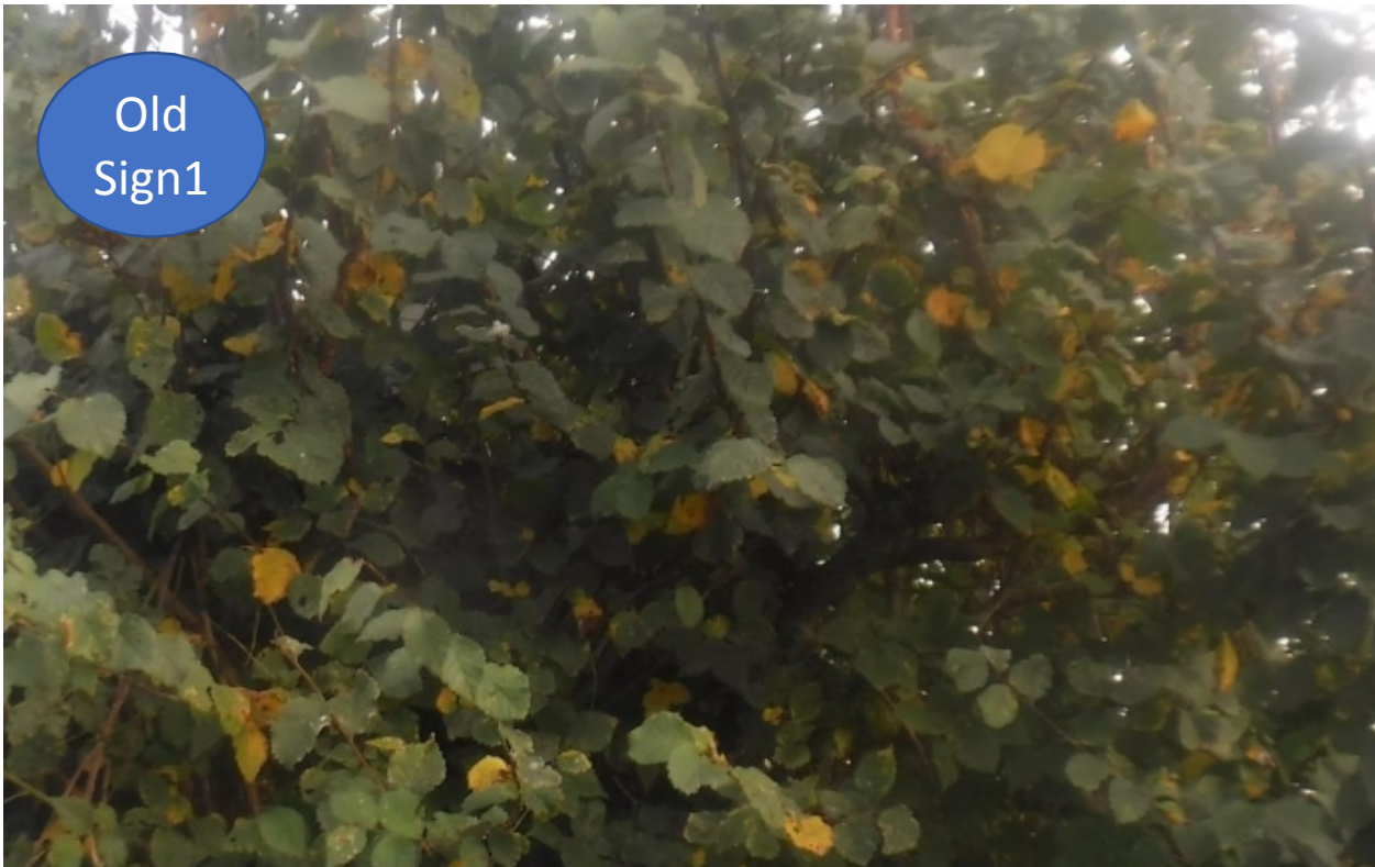
Bridleway Sign on the South Side